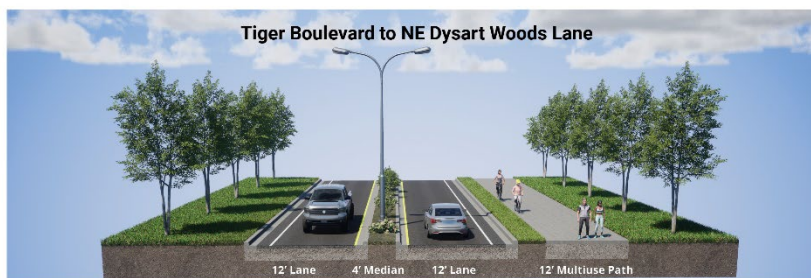
Figure 1: Typical Section – Tiger Boulevard to NE Dysart Woods Lane

As shown in Figures 1-5 , the proposed roadway would be two lanes with a raised grass median and transition to four lanes with a raised grass median to the proposed I-49 interchange; a roundabout at the intersection of NE J Street and Chapel Hills Drive/NE Heights Lane would also be included.